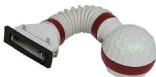
Golf Laptop cooler

Patent extendable circular-tube design needn't extra space and is convenient and portable. Raising 30% cooling efficiency.